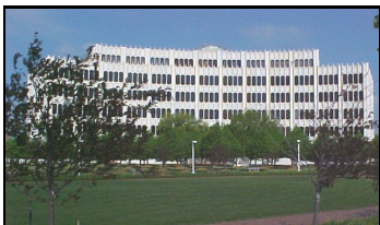
Connors and Hodge Buildings Current Rating: 75 (+2)