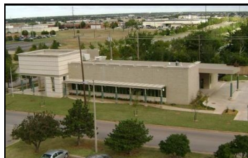
Banking Building Current Rating: 60 (+6)