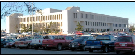
Department of Transportation Building Current Rating: 68 (E)