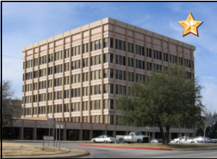
Kerr-Edmondson Building Current Rating: 91 (E)

For more information about the Energy Star, Energy Star rating system, or other aspects of Energy Star certification program, please visit the EPA's Energy Star Website .