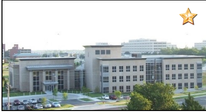
Attorney General Building Current Rating: 78 (+2)