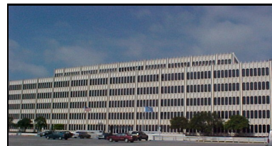
Sequoyah and Will Rogers Buildings Current Rating: 87 (+1)