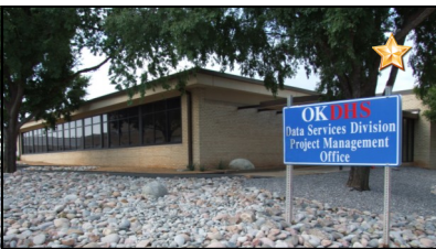
DHS-CAP Building Current Rating: 96 (+6)