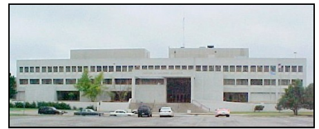
Denver Davison Courts Building Current Rating: 77 (+31)