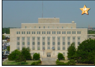
Jim Thorpe Building Current Rating: 83 (+1)