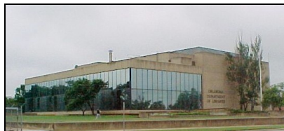
Department of Libraries Current Rating: 91 (E)