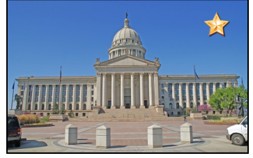
State Capitol Building Current Rating: 90 (+1)